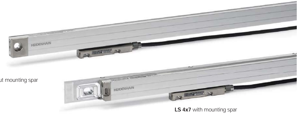
LS 4x7 without mounting spar